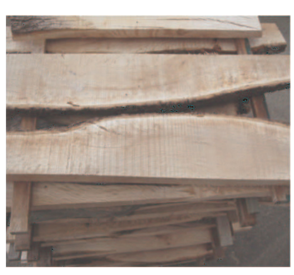
HOM OAK WOODFLOORING