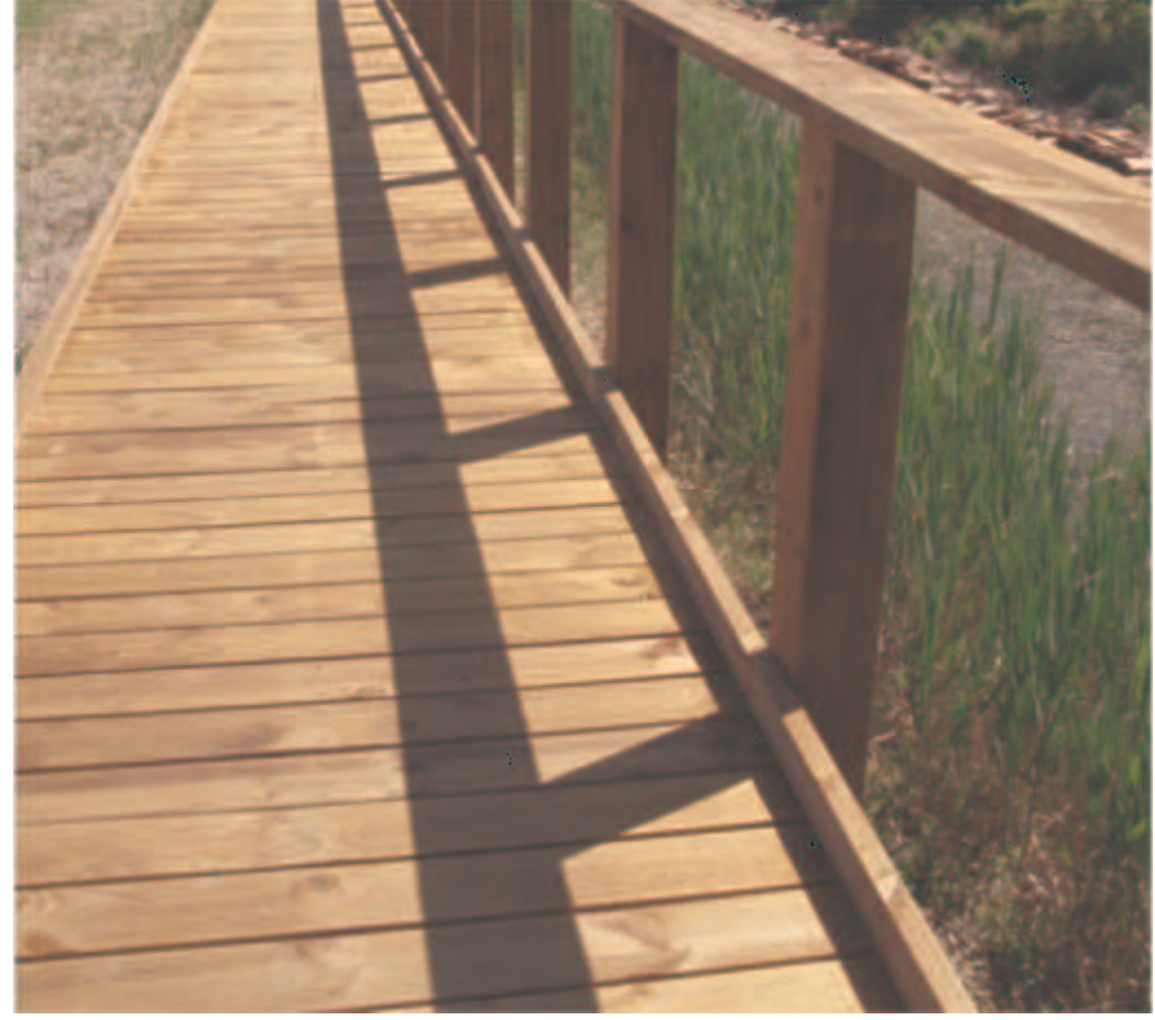
MEDITERRANEAN PINE WOOD